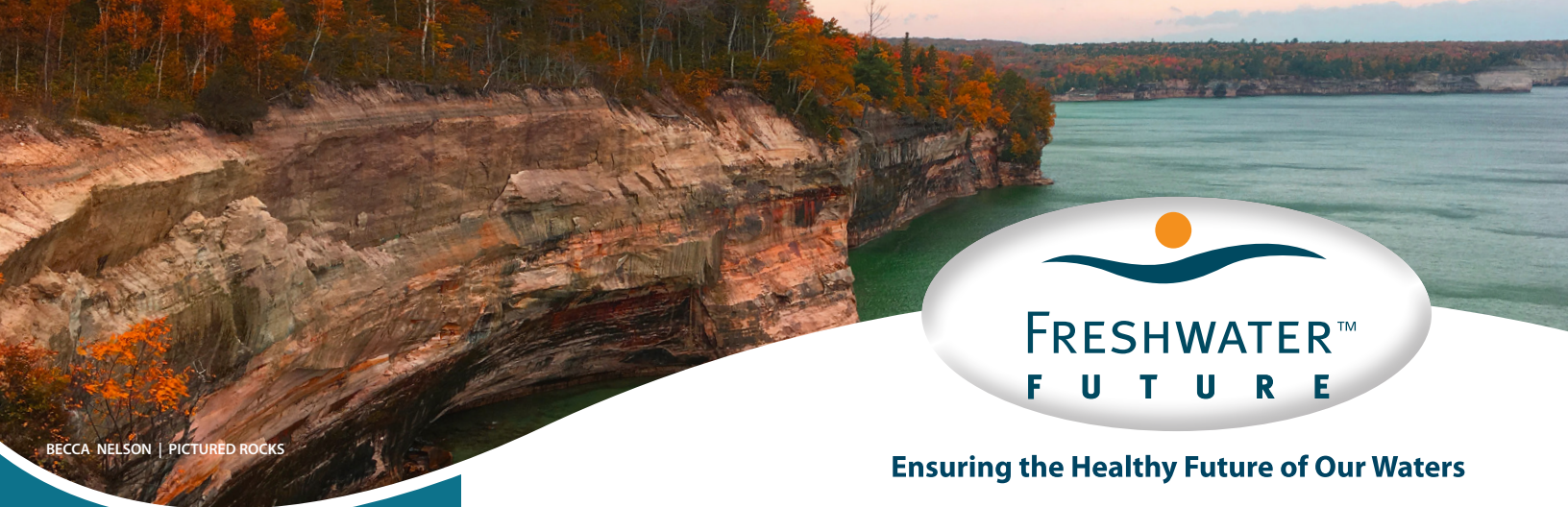
BECCA NELSON | PICTURED ROCKS